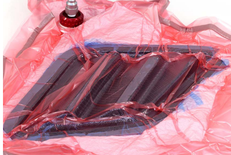
Once laminated, the part is vacuum bagged and cured in an oven at 120°C under vacuum.