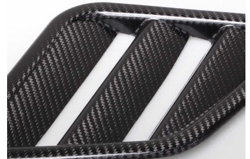
The cured part has a pin-hole free 'class A' surface finish straight from the mould.